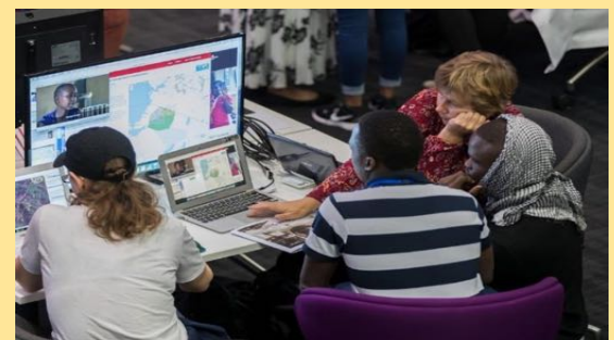
Mapping workshop in Tanzania