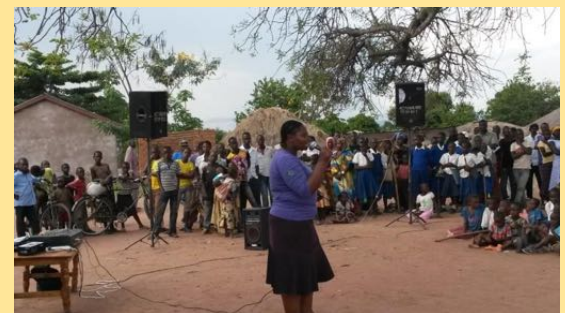
Fighting FGM – Roadshow in a village near Mugumu